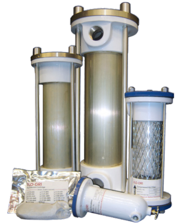
Table 14 – FLO-DRI Compressed Gas Scrubbing System