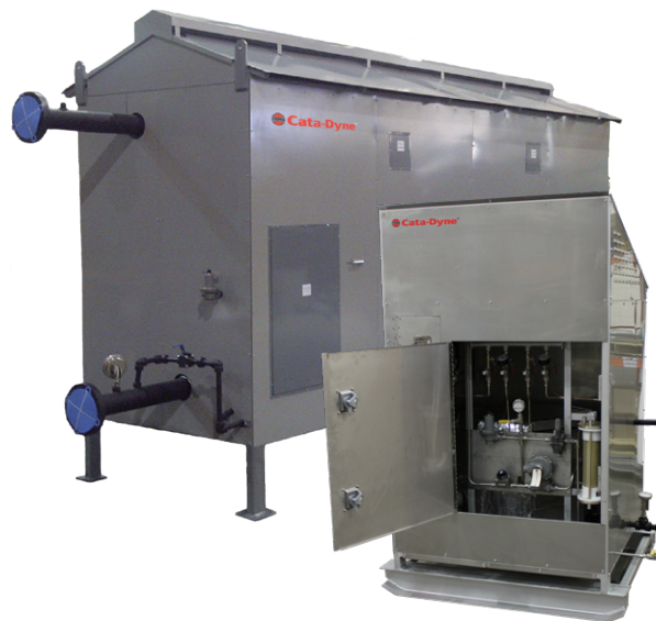
Table 15 – Line Heaters